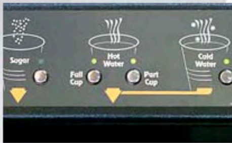
Double hot water selections as standard plus optional cold water dispense