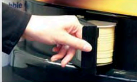
Unique high security cup door

This simple to operate, extremely good looking machine is sure to delight all users time after time.