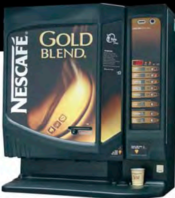
Style 5 shown with matching base cabinet